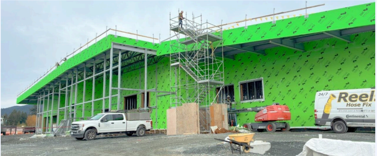
An updated photo of construction progress for the new Burke Mountain Middle/Secondary school

Newsletter from the SD43 District Parent Council